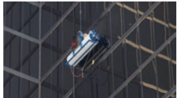
HR200 (7'/2 m)