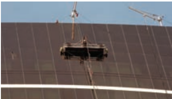
HR500 (16'/5 m)

The HighRise™ is a completely self-contained/self-climbing window cleaning system that can be operated from existing roof rigs, davit arms, roof cars or portable rigs. Operation is easy via a wireless remote control.